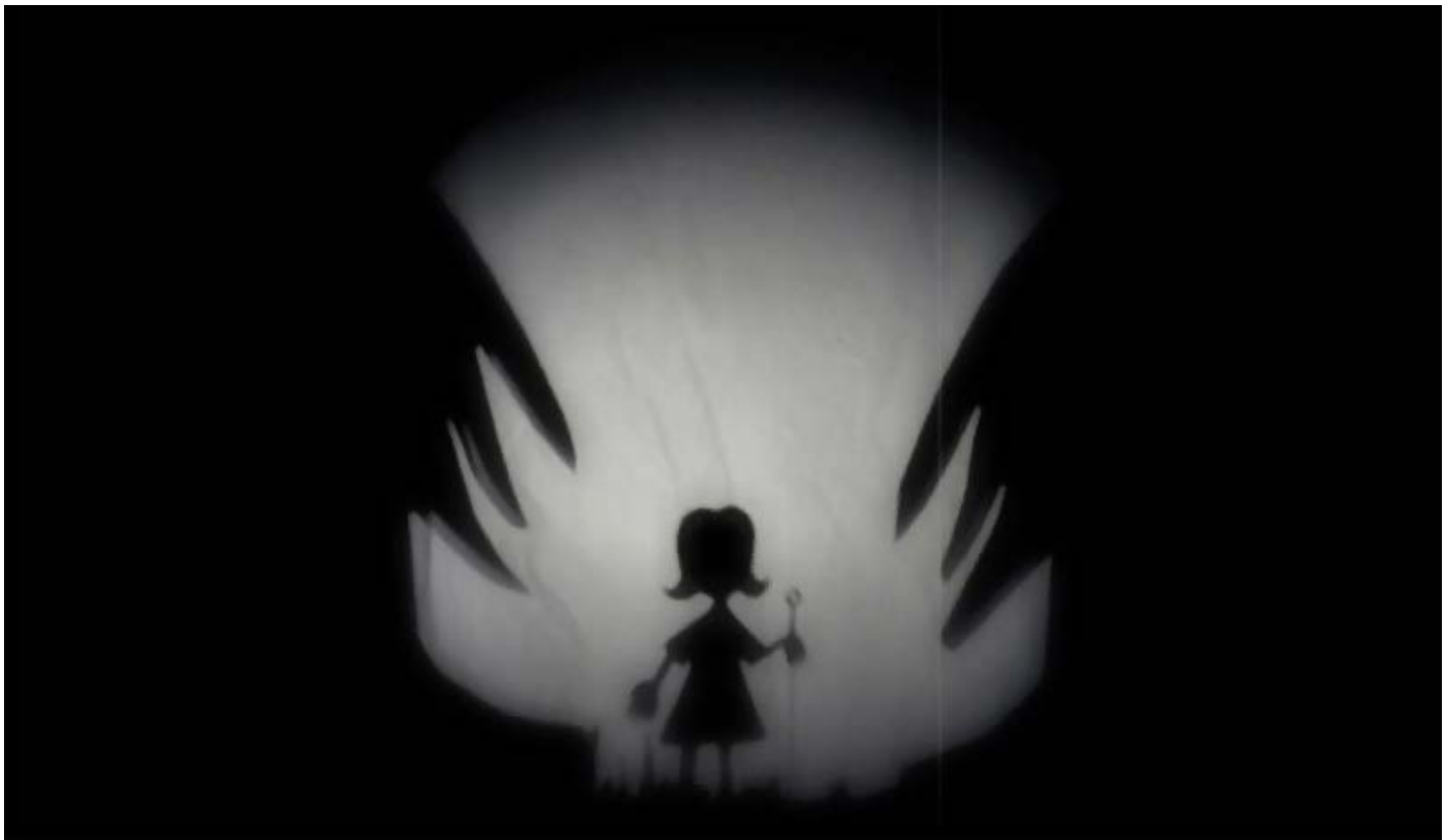
Bubble Girl , puppetry by Raymond Carr.

Idea Capital , the funding group that supports Atlanta artists' projects, has announced the winners of its 2017 grants.