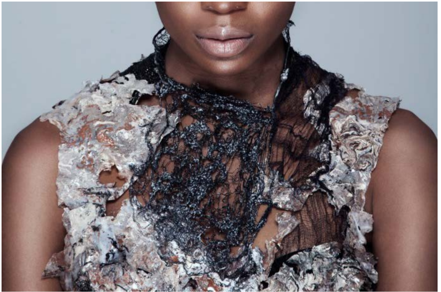
Gnarled wearable sculpture, by Charity Harris.