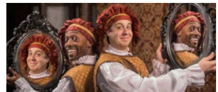
WHAT TO SEE, HEAR AND DO THIS WEEK, JANUARY 4–10