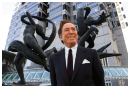
PORTMAN’S COMPLAINT: HOW JOHN PORTMAN BUILT MODERN DOWNTOWN ATLANTA AND CHANGED THE FACE OF URBAN AMERICA